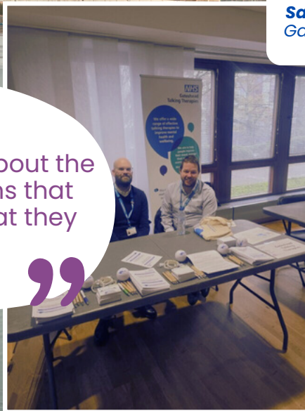
Support Manager, The Coquet Trust

“ It was useful to learn about the different organisations that are out there and what they offer. ”